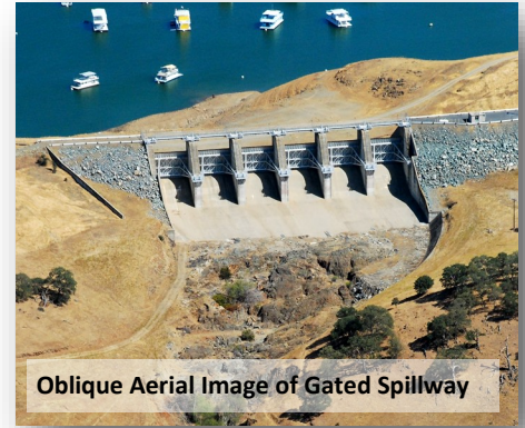
Oblique Aerial Image of Gated Spillway

Price Geographic Consulting is now offering aerial imagery, video and 3D models collected using Unmanned Aerial Vehicles (also know as drones). Ultra high resolution and up to date imagery and models can be generated that are extremely cost effective. Drones can fly from ground level up to 400' and capture detail and perspectives that are impossible with manned aircraft. Imagery and video can even be captured indoors! From Imagery to 3D Models to Volume Calculations to Real-time Monitoring, PGC has a custom drone mapping solution for you.