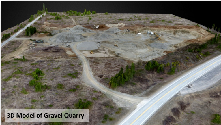
3D Model of Gravel Quarry